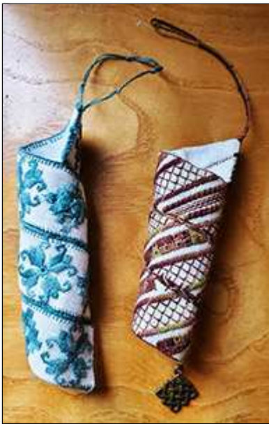
"Water Spiral" / "Earth Spiral" stitched by Kathryn Lord

The remaining books from the dissolved CRVC library, as well as other books and needlepoint canvases that have been donated to the chapter, are now available for purchase. Click here to view/order the available items.