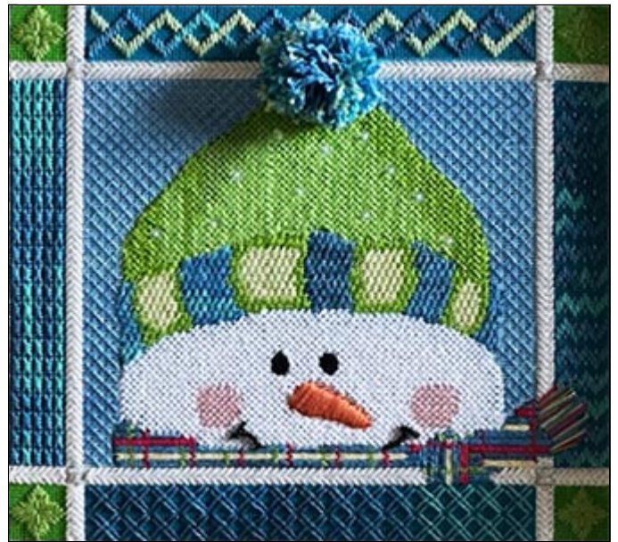
"Brrr.... Snowman" stitched by Pat Karpenko from the December "Snow Day" workshop