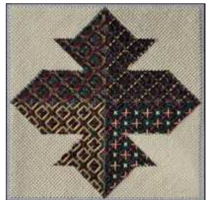
Color choice: Jewel

A coupon is provided for this meeting. Deadline for registration is April 1st.