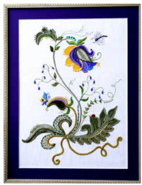
Serenity — Sylvia Murariu — Romanian point lace, beading, and surface embroidery