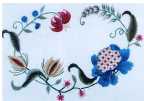
Stitched by Judy

Project: Picture Size: 7" x 10" oval design Fabric: Linen twill Threads: Appleton crewel wools Colors: Student's choice Skill level: Intermediate Prerequisites: None