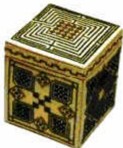
Outside of box